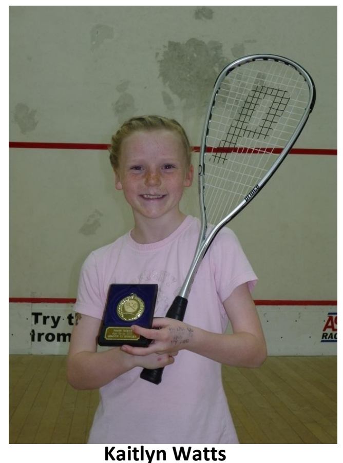
Central Squash Under 11 and 13 Girls Champion North Island Under 11 Girls Champion New Zealand Under 11 Girls Champion

Incorporating Manawatu, Wanganui, Ruapehu & Taranaki Regions lifestyle, fun and fitness